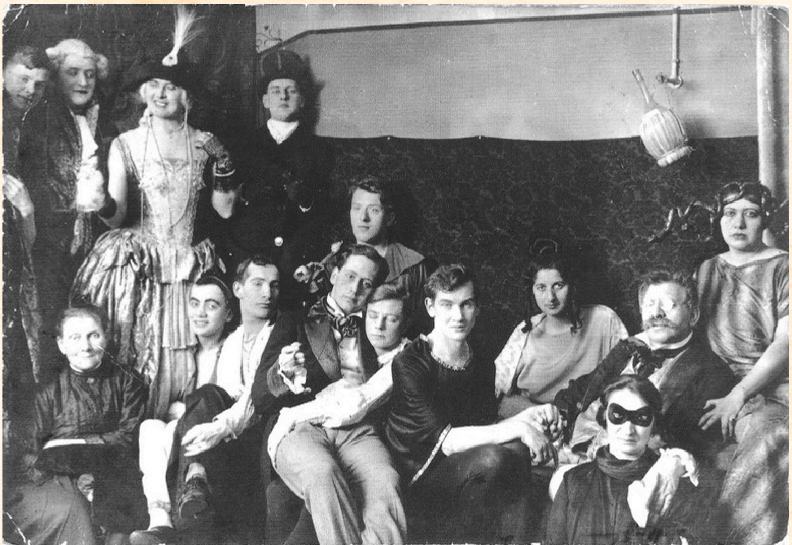
Magnus Hirschfeld (at right with glasses and bushy mustache, holding the hand of his lover, Karl Giese) at a costume party at the Institute of Sexual Science, 1920.

The production contains intense political themes, references to fascism, war and emotional distress